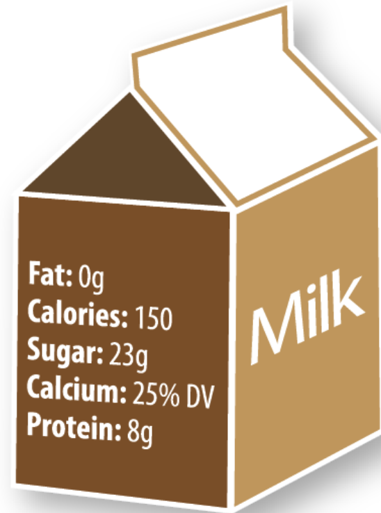
NONFAT CHOCOLATE MILK