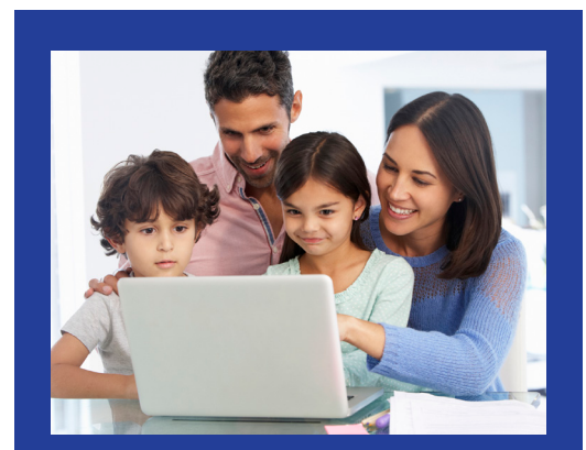
CONNECT WITH US! View this report online at HealthyEating.org/2019AnnualReport